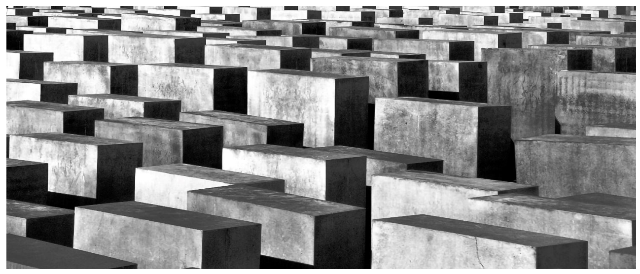
Fig.1. The Memorial to the Murdered Jews of Europe , Berlin. Peter Eisenman.