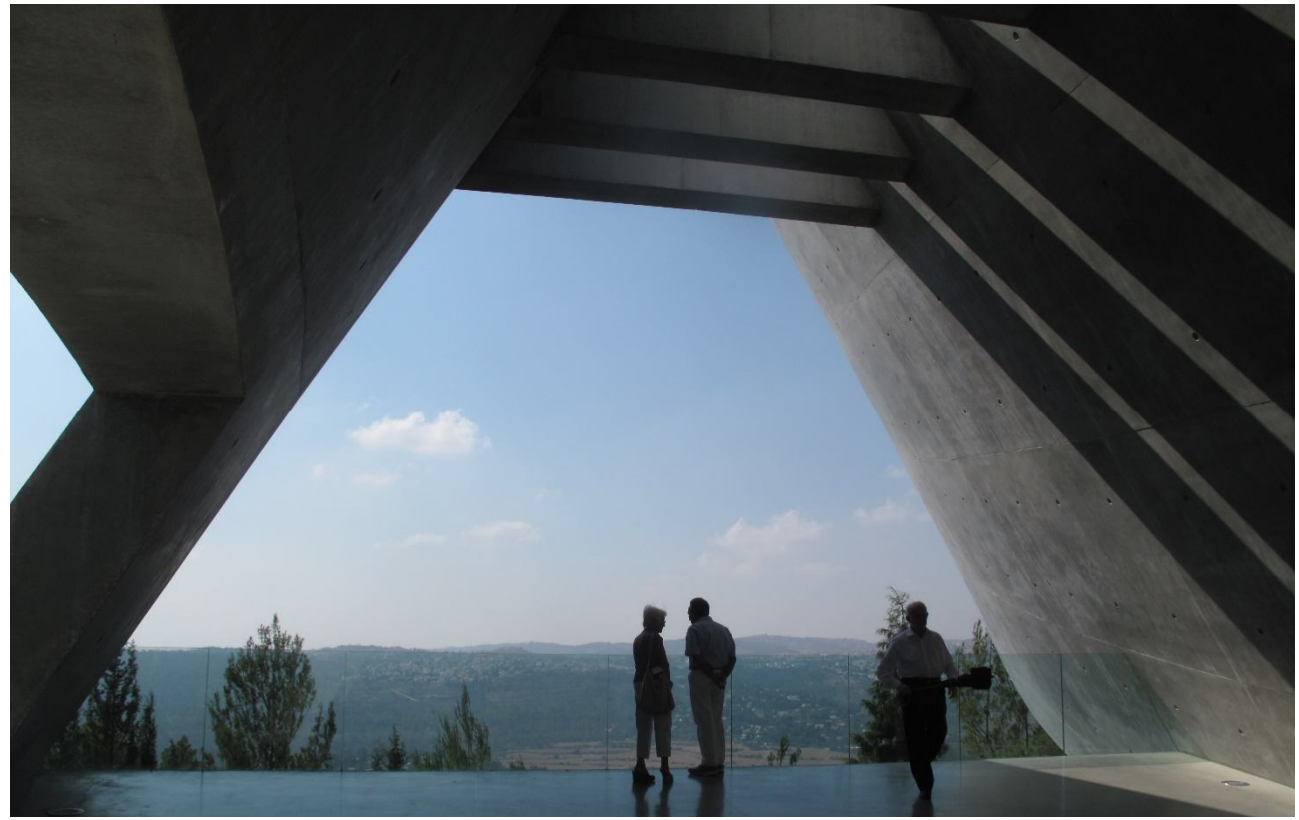
Fig.5. Yad Vashem, Jerusalem. Moshe Safdie.

of constriction and oppression through architecture. Both have a deep emotional impact and, although different in their ways of proceeding, both coincide in raising the sensation of terror, loss and impotence. The visitor is not only exposed to the photographs and the objects of the victims, but to the same process of becoming a victim. Such is the Holocaust Tower of the museum conceived by Libeskind, where the sensation of the visitor is that he is inside a chimney pipe; this sensation is augmented by the zenith ray of light that constitutes the only source of illumination in the chamber. When touring both museums, the final sensation shifts from desperation to hope; in the case of Libeskind's museum, this is represented by a garden from which one can gaze at the sky, while in the case of Safdie's building, by an open terrace in the end of the tour offering an ample panorama (Fig. 5).